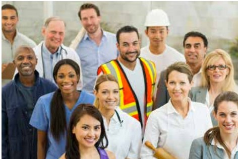
Getting a Job