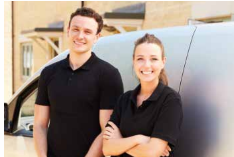
Getting into Self-employment