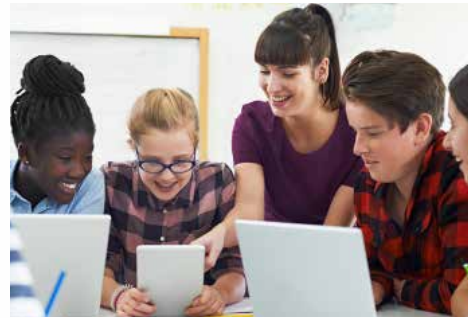
Choosing subjects and courses at 16